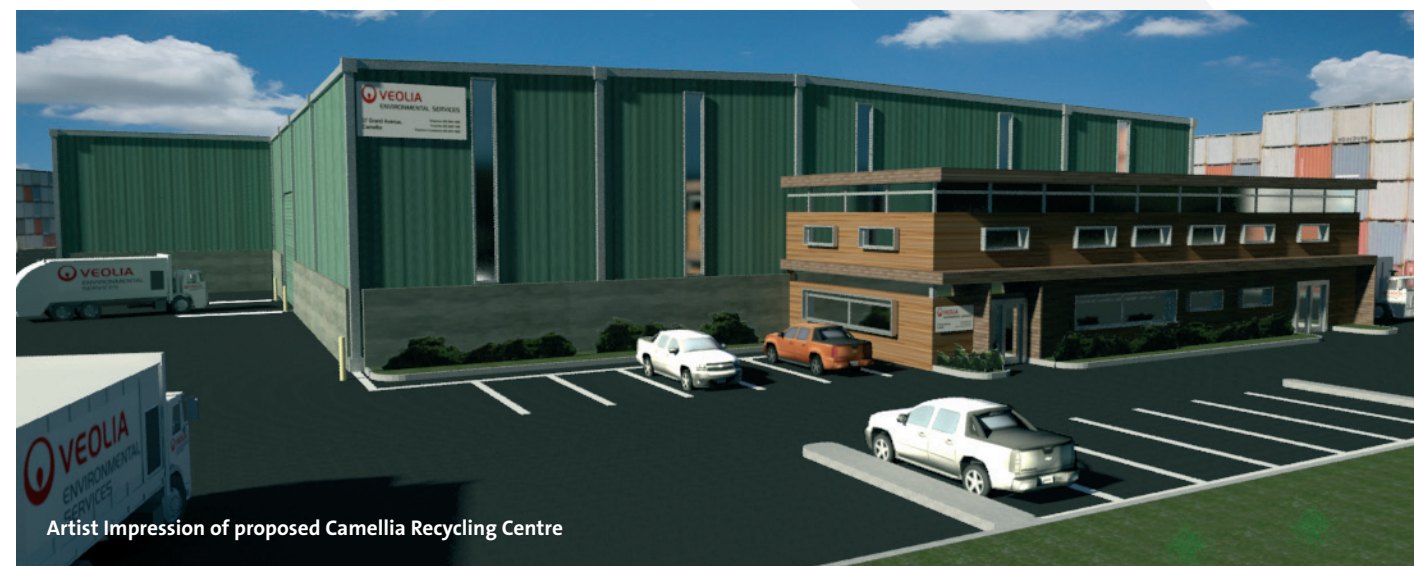
Artist Impression of proposed Camellia Recycling Centre

Veolia proposes to commence construction of the Camellia Recycling Centre in 2013 pending development approval. The facility is expected to provide employment and business opportunities within the local community during both the construction and operational phases.