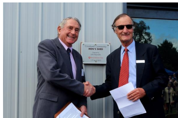
Support of construction of the Crookwell Men's Shed project