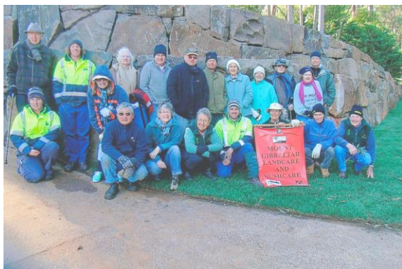
Mt Gibraltar Land Care and Bush Care members with the commemorative entrance trachyte retaining wall