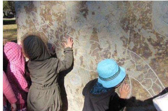
The Dhurga Rock project recognises the importance of Aboriginal history in the Braidwood district