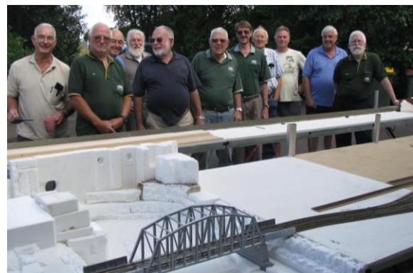
Milton Ulladulla Model Railway Club's realistic sight and sound layout