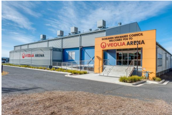
Construction of the Veolia Arena at the Goulburn Recreation Area provides a large indoor facility