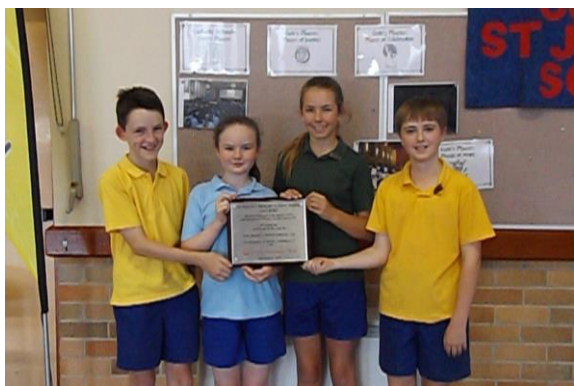
St Joseph's Primary School Goulburn undertook renovations to toilet facilities and upgraded heating in the school hall