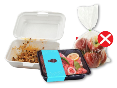
Packaged food (remove from packaging)