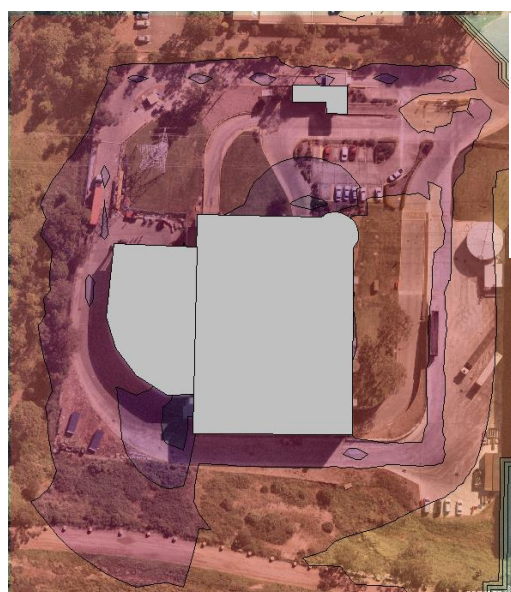
Figure 2.2: L_{Aeq,15m} noise contours - Day

N.B. The NPI uses day (07-18), evening (18-20) and night (20-07) assessment periods when assessing impacts to residential receptors. The periods adopted for this assessment align with site operations because the project trigger noise level for industrial receptors is independent of the time of day.