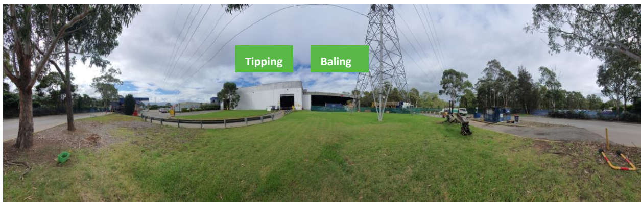
Photograph 2.1: Site from Measurement Location

We conducted attended measurements at the site between 10:00 hours and 11:00 hours on 05 April 2023. These measurements were used to confirm the validated noise model. The weather was dry with a slight and intermittent southerly breeze. The site seemed busy. There was a near continuous stream of trucks entering and leaving the site most of the time. Industrial noise emanating from operations at Wetherill Park RRF (engine noise from plant within the RRF and arriving/departing trucks) dominated the soundscape during the measurements.