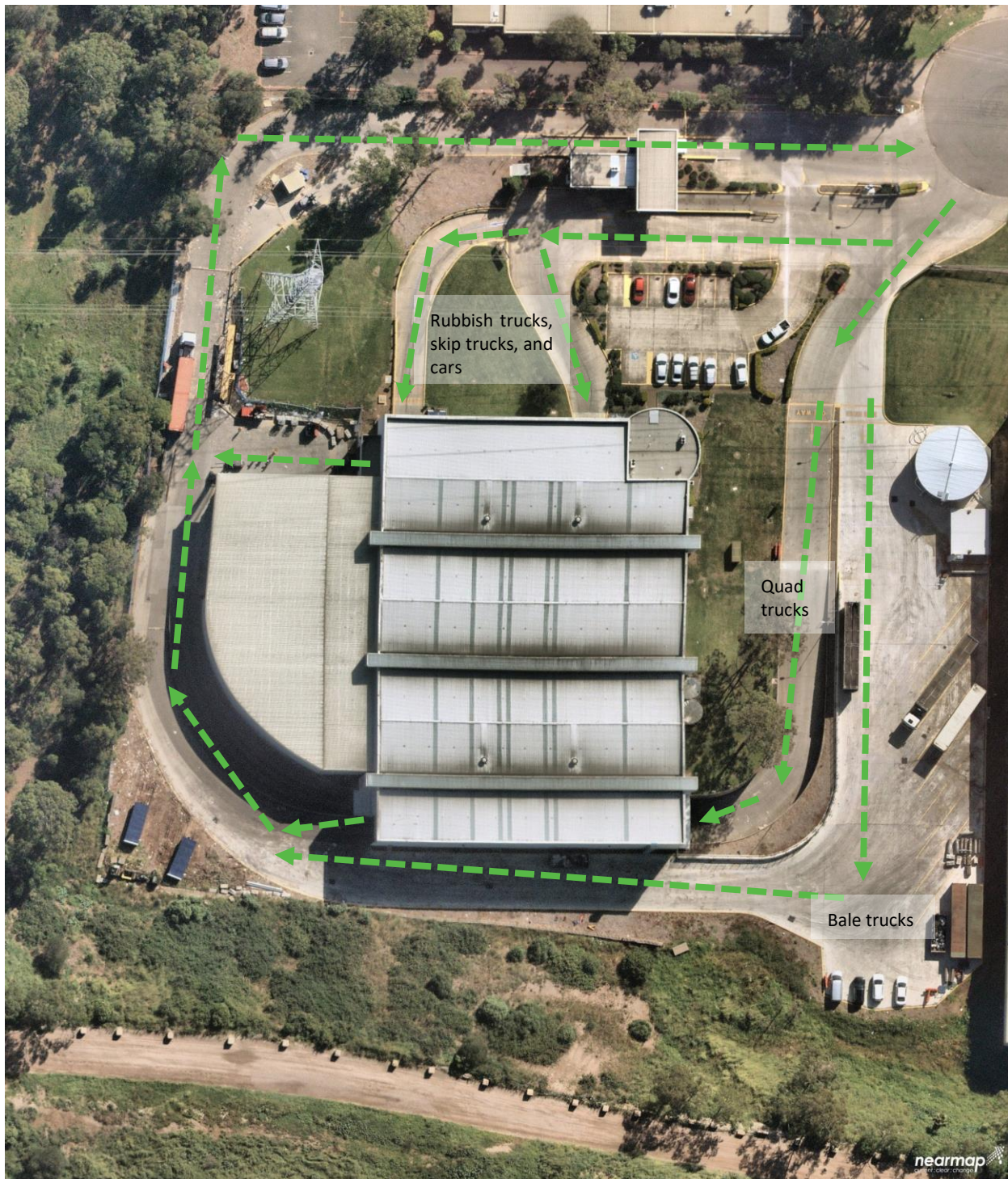
Figure A.1: Routes of trucks