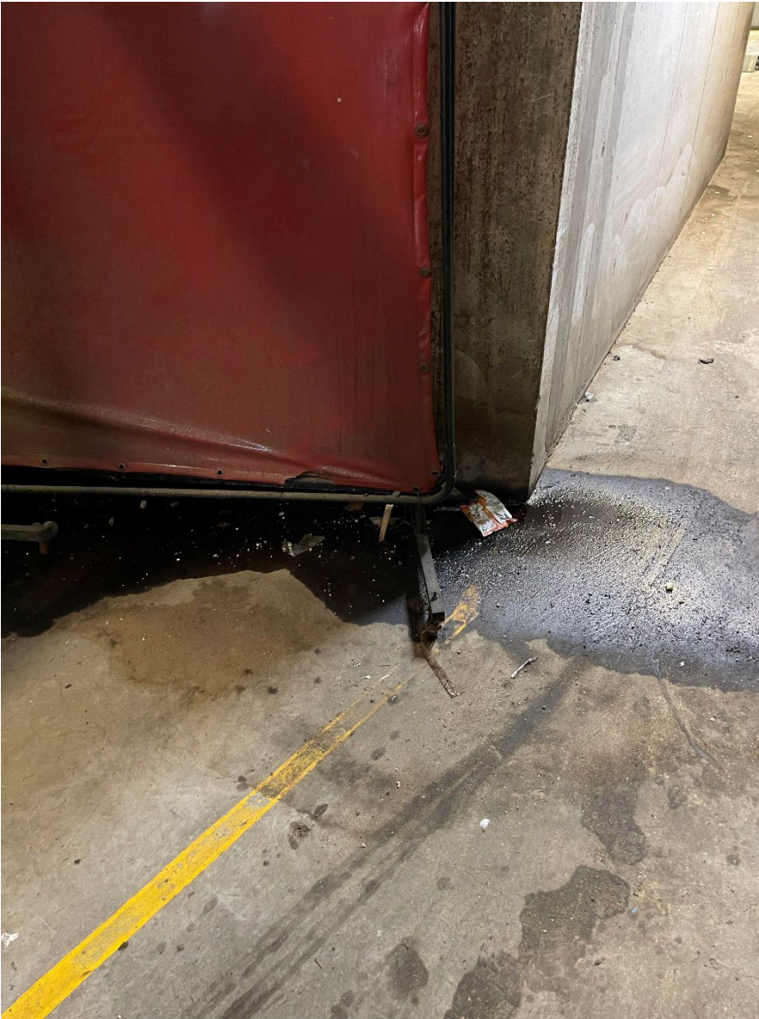
Figure F1. A small leak in the leachate transfer line causing pooling leachate on the floor, with the potential for odour emissions.