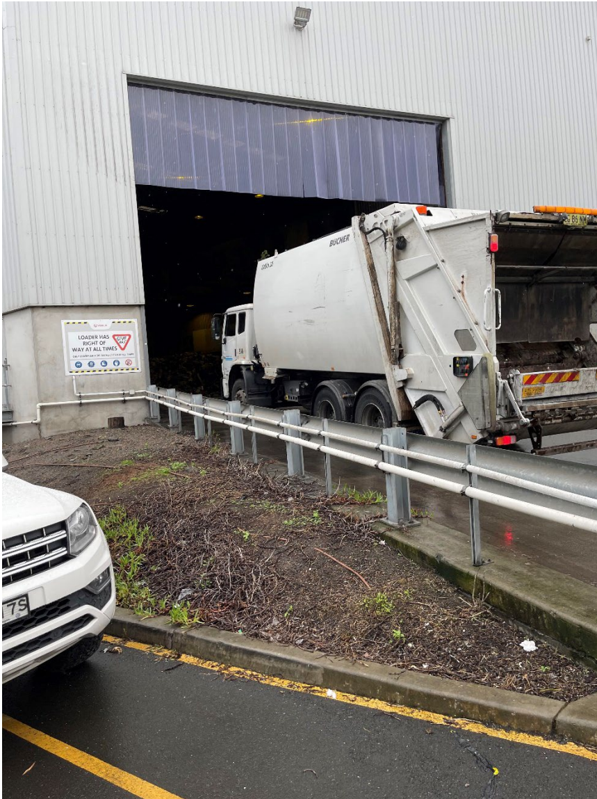
Figure F9. Plastic flaps above the point of entry to the waste receive hall used to optimise negative pressure and control odour emissions.