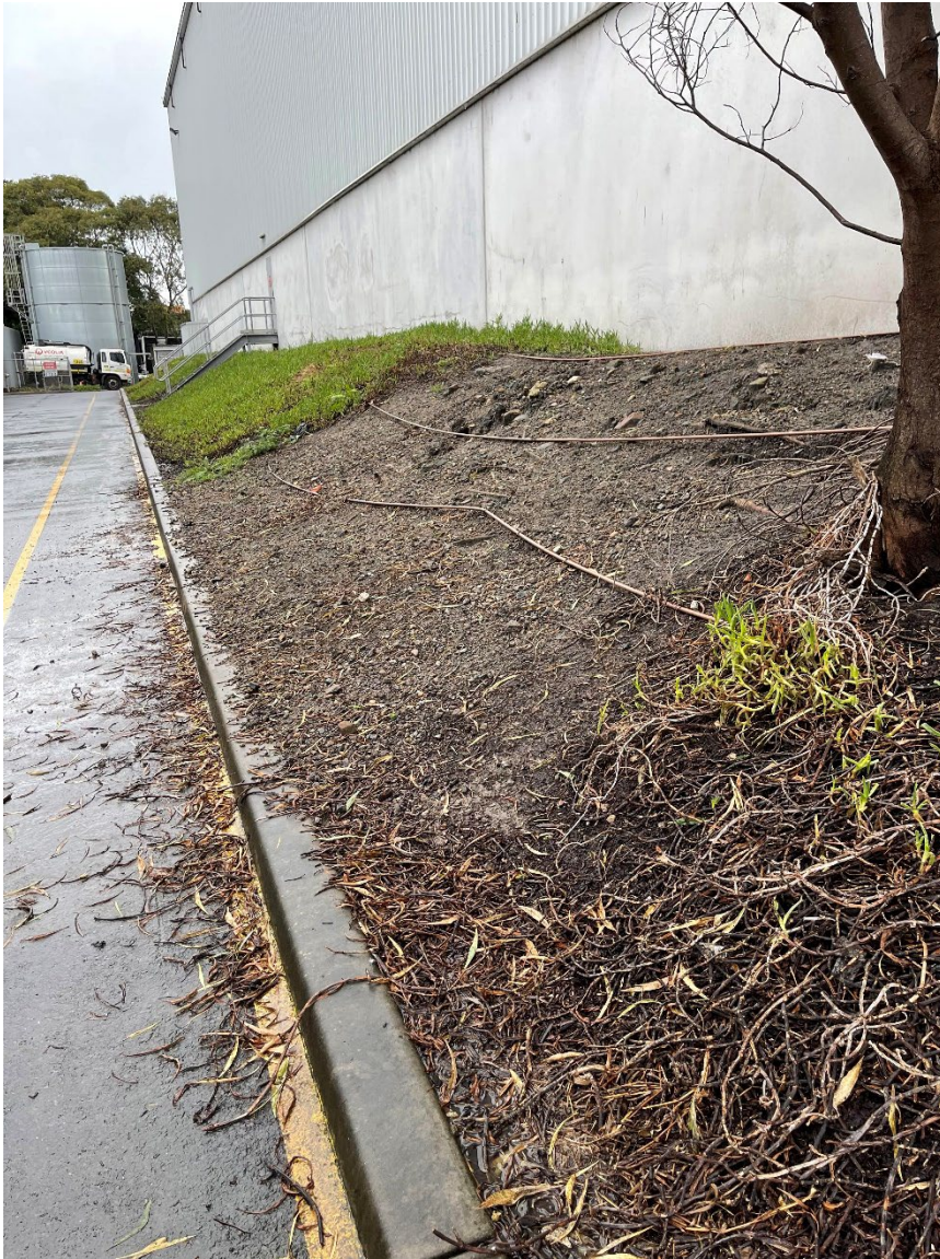
Figure F7. Failed landscaping needing repair.