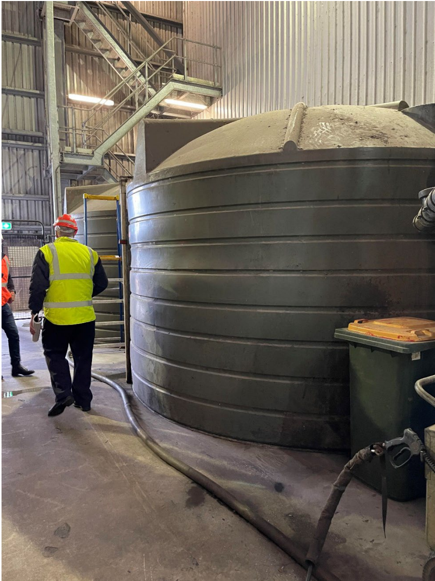
Figure F13. Secure leachate storage tank.