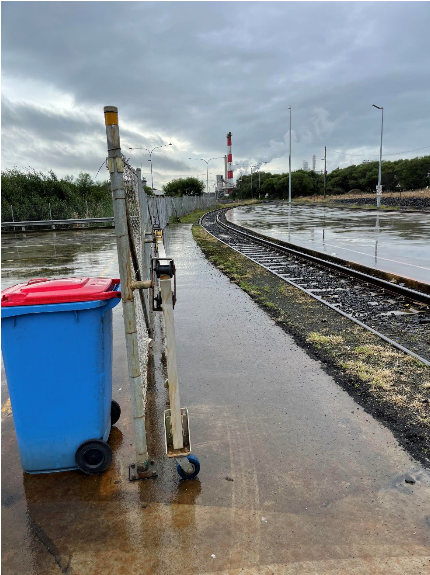
Figure F11. Clean container loading rail siding.