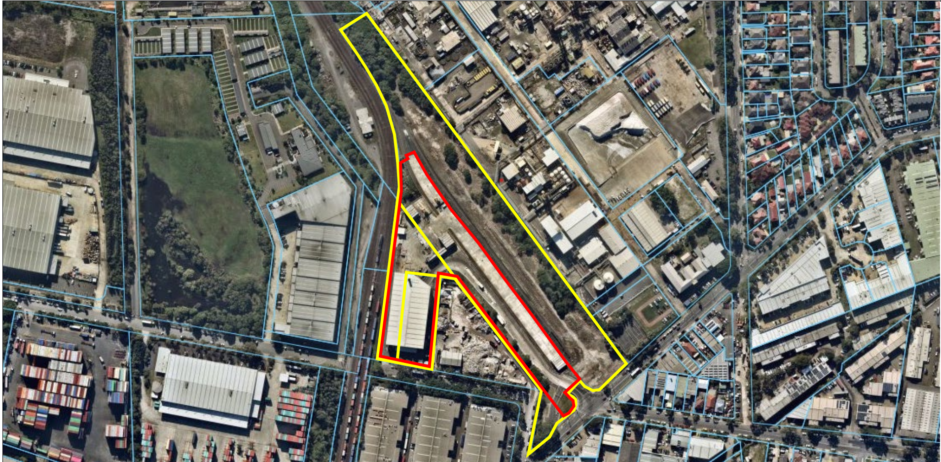
Figure 1.1. Spatial scope of the 2022 Independent Environmental Audit – Banksmeadow Transfer Terminal (lot boundaries are shown in yellow; site boundaries, relevant to the audit are shown in red).