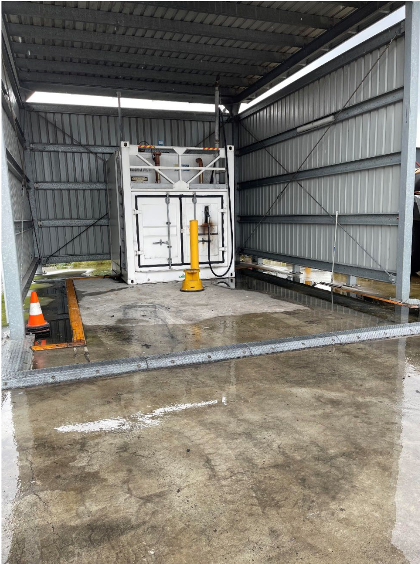
Figure F3. Outdoor diesel storage with rainwater ingress in bunding.