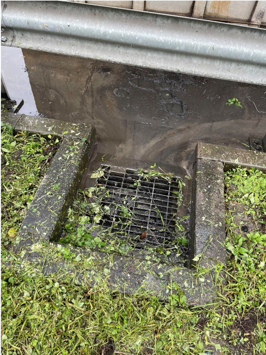
Figure F5. Stormwater pit requires cleaning.