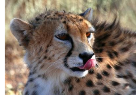
Persian Leopard (Iran)