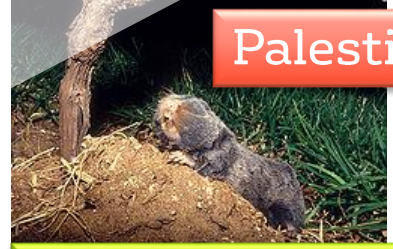
Blind Mole Rat