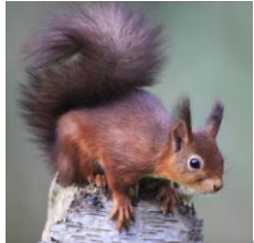
Red Squirrel (UK)