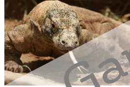
Komodo Dragon (Indonesia)