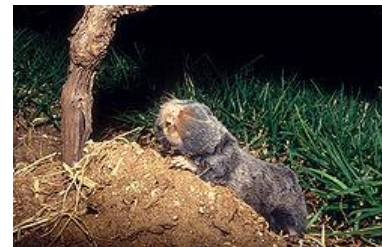
Blind Mole Rat