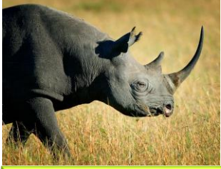
Black Rhino (Tanzania)