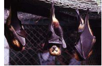
Black-spined Flying Fox