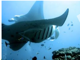
Manta Ray (Myanmar)