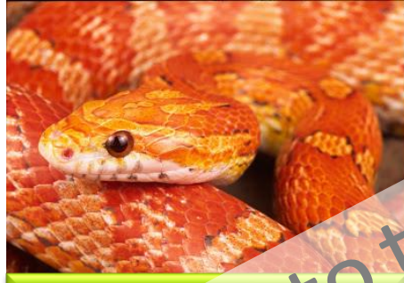
Corn Snake (USA)