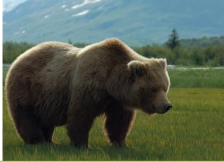
Grizzly Bear (Canada)