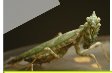
Thistle Mantis (Egypt)