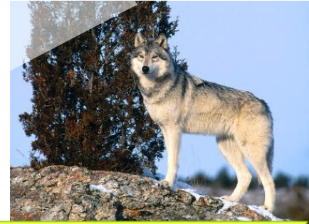
Grey Wolf (Iraq)