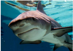
Bull Shark (Morocco)