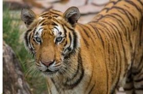
Royal Bengal Tiger (Bangladesh)