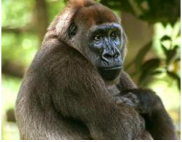
Cross River Gorilla (Cameroon)