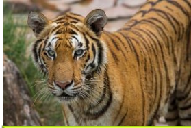
Royal Bengal Tiger