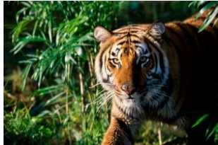
Royal Bengal Tiger