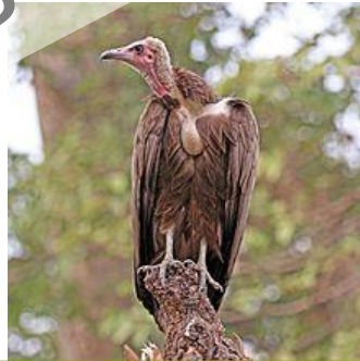
Hooded Vulture (Chad)