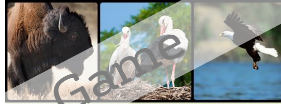
European Bison, White Stork and Bielik Eagle (Poland)