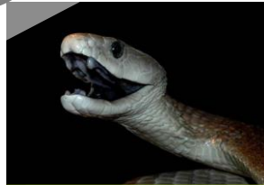
Black Mamba (South Africa)