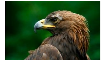
Golden Eagle (Germany)