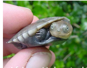
African Helmeted Turtle (Ghana)