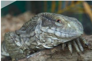
Savannah Monitor (Eritrea)