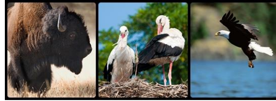
European Bison, White Stork and Bielik Eagle