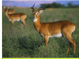
White Eared Kob (Sudan)