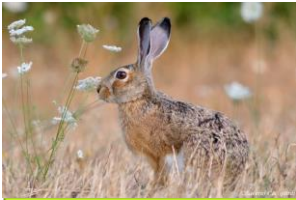
Corsican Hare (Italy)