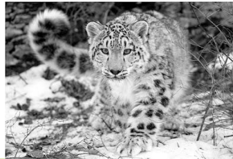
Snow Leopard (Uzbekistan)