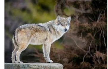
Iberian Wolf (Portugal)