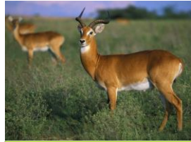
White Eared Kob