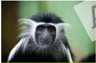
Colobus Monkey (Rwanda)