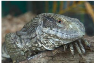
Savannah Monitor (Eritrea)