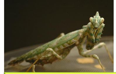
Thistle Mantis (Egypt)