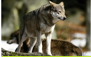
Eurasian Wolf (France)