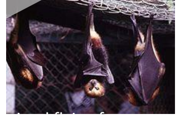
Black-spined flying fox (Mauritius)