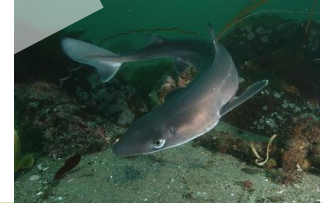
Spiny Dogfish (Belgium)