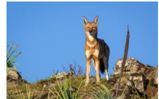
Simien Fox (Ethiopia)