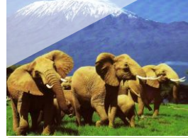
African Elephant (Kenya)