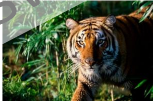
Royal Bengal Tiger (India)