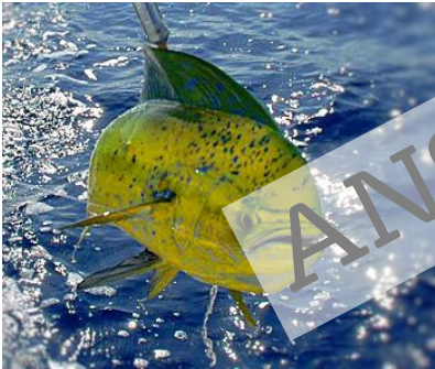
Mahi Mahi (Oman)