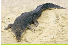
Saltwater Crocodile (Sri Lanka)