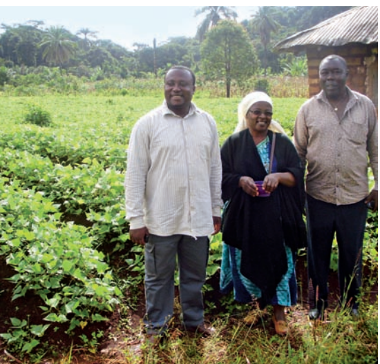
A field fertilized with urine